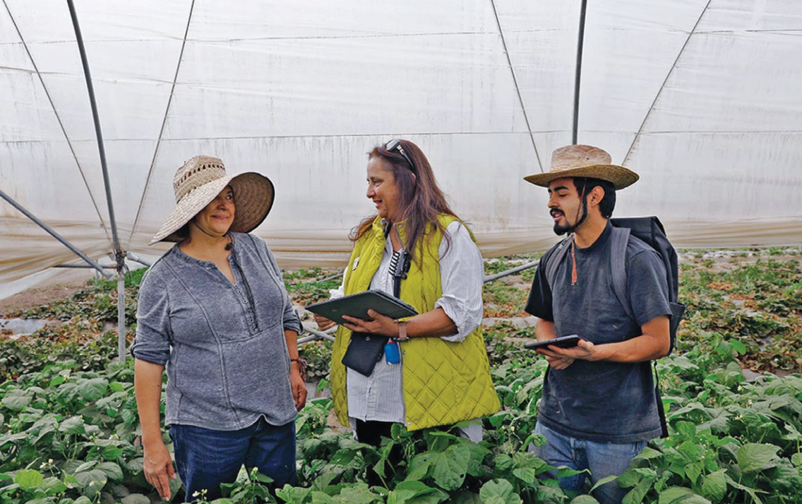
AG Tools optimizes the food and agricultural supply chain by providing real-time data analytics to farmers, buyers and shippers.